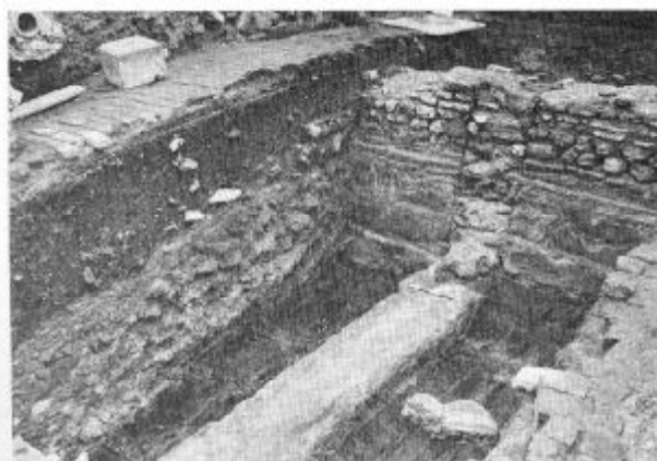
Fig. 3: Redeposited debris (in section) found on the recently excavated site at Peninsular House, overlying an unburnt floor of early 2nd century date

Secondly, most of the Hadrianic debris seems to be redeposited, especially along the waterfront (e.g. sites 198, 193) thus paralleling the dumps along the Walbrook valley and waterfront area to the west (site 75 etc.). This situation has been illustrated most graphically at the recent excavation at Peninsular House (Fig. 3) where dumps of Hadrianic debris overlay a wooden floor which had definitely not been burnt ( pers. comm. from G. Milne, in advance of publication, for which thanks). It would seem that the clearing up operations in the north-west of the city involved redeposition in other parts of the settlement area.