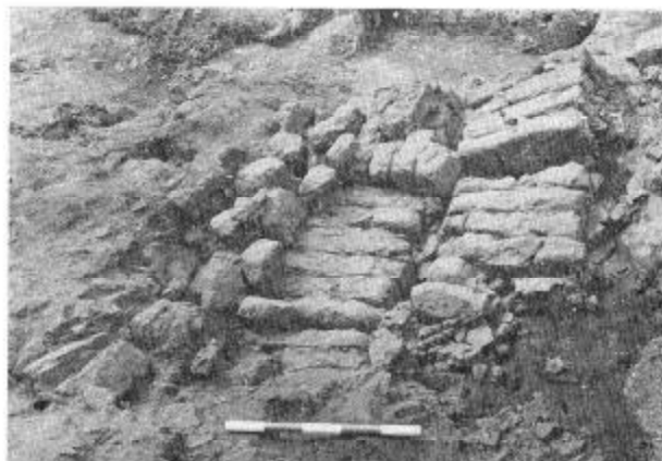
Fig. 2: Articulated bricks of a fallen wall of a building on Site 5, destroyed in the Hadrianic fire.

Further north, sites 168, 170, 172 and 175 revealed extensive layers of burnt debris "up to three feet thick". 15 At site 170, it covered late first century objects, and was 2 ft 3 ins above natural brickearth, but elsewhere lay "actually on the brickearth. This might suggest an early date, but perhaps there had been some removal of first century layers". 16 Dating evidence for 168 is contradictory, suggesting late first century and possibly earlier in one source, 17 whereas elsewhere 18 a fire "on or near the site, perhaps in the early second century" is postulated. The inconsistent dating evidence, relationship with natural and depth of deposit imply that further redeposited debris is represented here. Nearby, more recent work, on site 173, revealed fire deposits of Flavian date, but no associated structures and so may be redeposited.