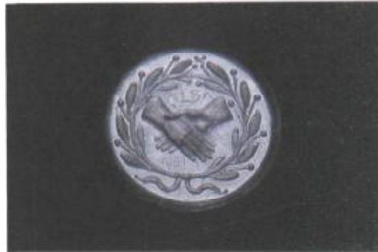
Plate. 1 Eastcheap Gems: Intaglios from Eastcheap.